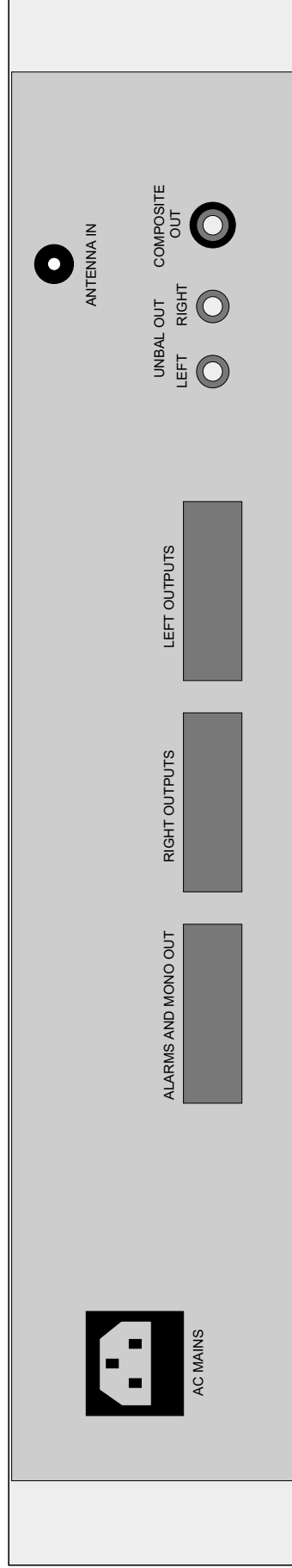
RMR-01 REAR ELEVATION